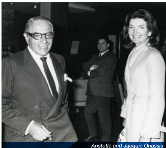
Aristotle and Jacqueline Onassis

"We develop a model in which males engage in conspicuous consumption to send an honest signal of their quality to females. Females respond to the costly signal, increasing the prevalence of signalling males over time. As males fund conspicuous consumption through participation in the labour force, this gives rise to an increase in economic activity and growth," Jason said.